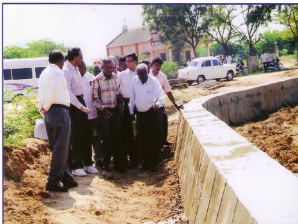
KAIKULAM TANK PROTECTION WALL DURING THE INSPECTION OF PWD SECRETARY AND PWD OFFICIALS